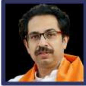
Shri. Uddhav Thackeray