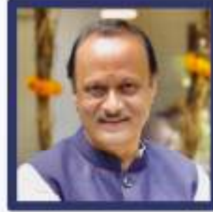
Shri. Ajit Pawar